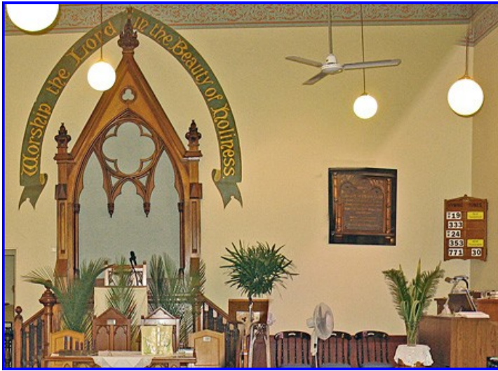
St. Andrew's Church on Palm Sunday - Palms displayed in memory of Jesus' triumphal entry into Jerusalem.