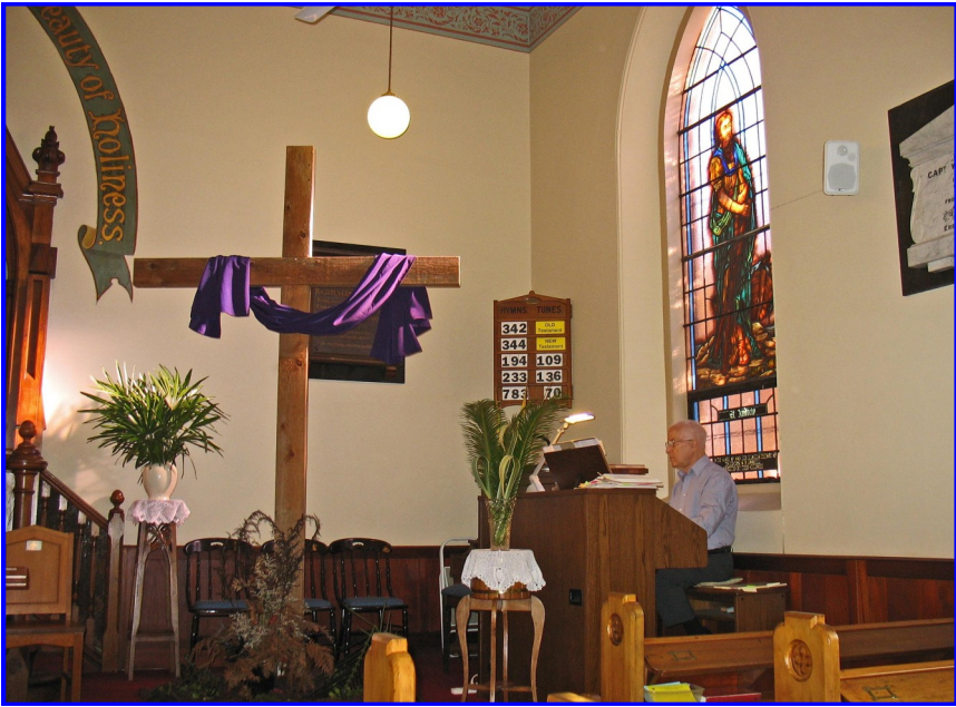
St. Andrew's Church on Good Friday