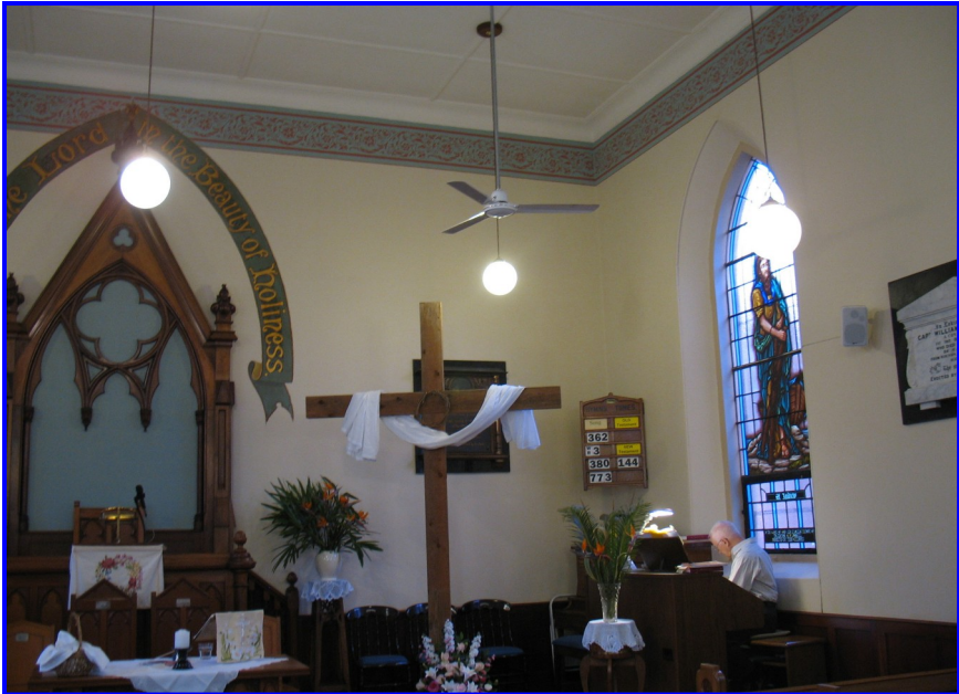
St. Andrew's Church on Easter Sunday