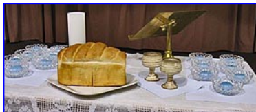
Maundy Thursday 'Service of the Shadows' A meal of unleavened bread, roast lamb & cinnamon, grapes, apple & bitter herbs. Holy Communion; Readings, prayers and hymns in memory of the Last Supper.